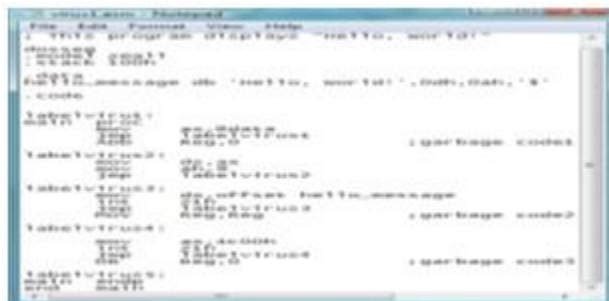
Figure 1: Assembly code of Virus File

The mutating behaviour of metamorphic viruses is due to their adoption of code obfuscation techniques like dead code insertion, Variable Renaming, Break and join transformation. Figure 1 shows the assembly file of the virus code. Computer viruses like polymorphic viruses and metamorphic viruses use more efficient techniques for their evolution so it is required to use strong models for understanding their evolution and then apply detection followed by the process of removal. Code Emulation is one of the strongest ways to analyze computer viruses but the anti-emulation activities made by virus designers are also active [4] [5] [6][7] [8].